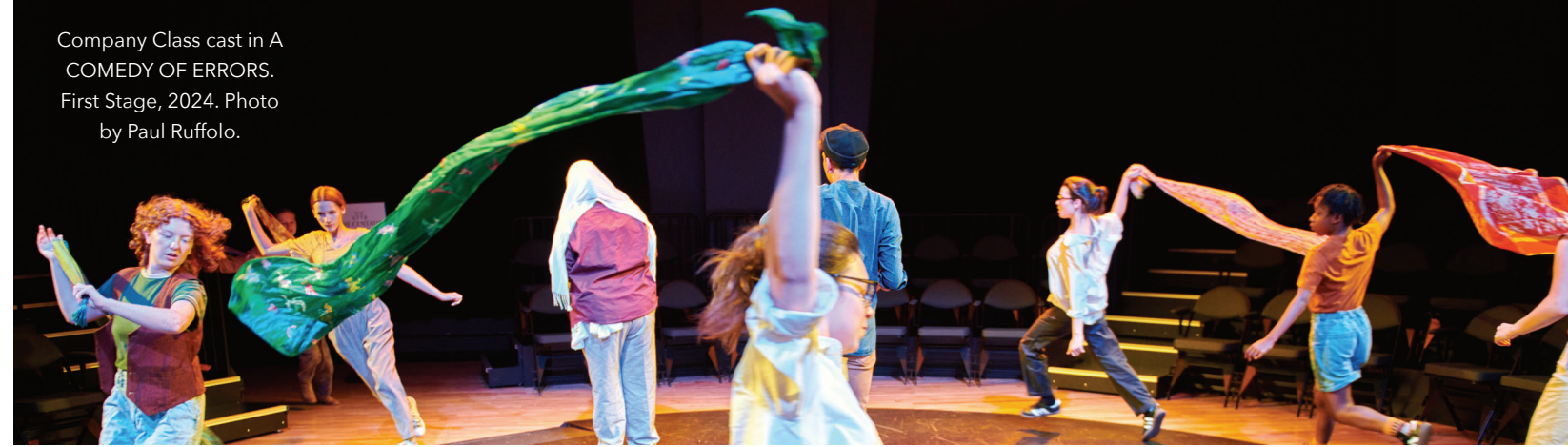
Company Class cast in A COMEDY OF ERRORS. First Stage, 2024.

Scan the QR code to sign up for a Company Class audition or visit firststage.org/company-class